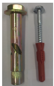
Fixing 003 Fixing 005